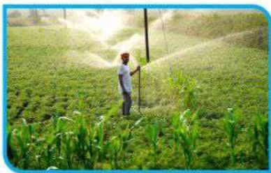
Middle Size Farmer and Farm House