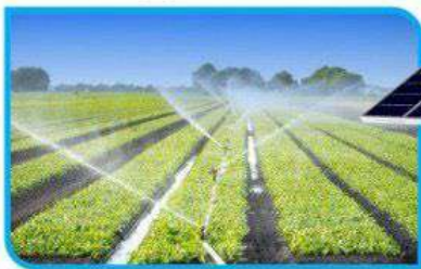
Big Farmer and Farm House