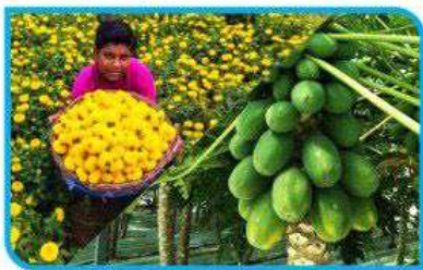
Flower, Fruit Farmer and Bangle Size Family