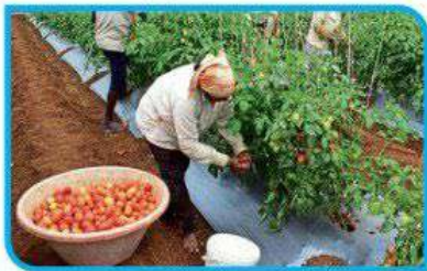
Small Size Farmer and Bangle Size Family