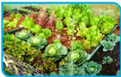
Vegetable Farmer and Middle Size Family